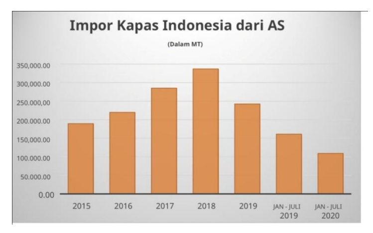
Figure 3. Cotton Data Import From US

In Figure 3, Indonesia has decreased in demand for the textile industry capacity. Indonesia's cotton imports for the January-July 2020 period fell 20 percent to 302,370 tons (equivalent to 1,389 bales). This figure slightly decreased compared to 379,203 tons (equivalent to 1,742 bales) during the same period in 2019. Following a record year for the US cotton exports in 2018, and a moderate decline in 2019 as a result of high residual stocks and sluggish domestic demand, Indonesian cotton imports from the US fell by 32% to 109,081 tonnes (equivalent to 501 bales) from 161,004 tonnes (equivalent to 739 bales) imported during the same period in 2019.